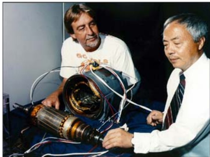
ORNL researchers examine the armature of a new soft-commutated DC motor.

The energy associated with the residual current of the commutated coils is dissipated in an attenuation circuit that can be recycled back to the DC power supply. This reduction in spark generation extends the brush life.